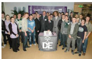
Participants at the launch of the DofE at South Devon College

The Regional Office will always look at organisations who approach us about applying for an Independent Licence and each case is taken on an individual basis. However, as you can see the end result is not always an Operating Authority Licence – but we can always guarantee that the best course of action for the DofE will be taken.